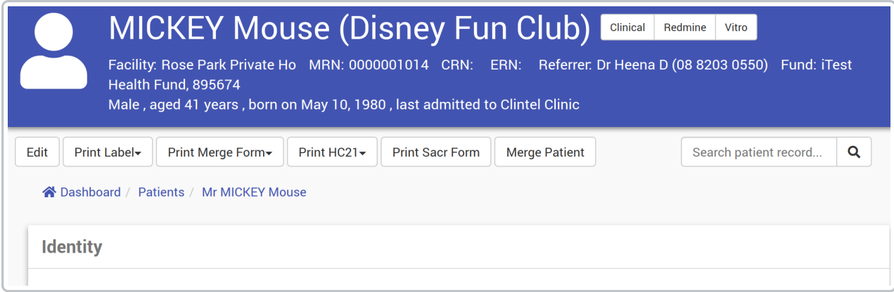
Table Headings > Now stay on screen when scrolling